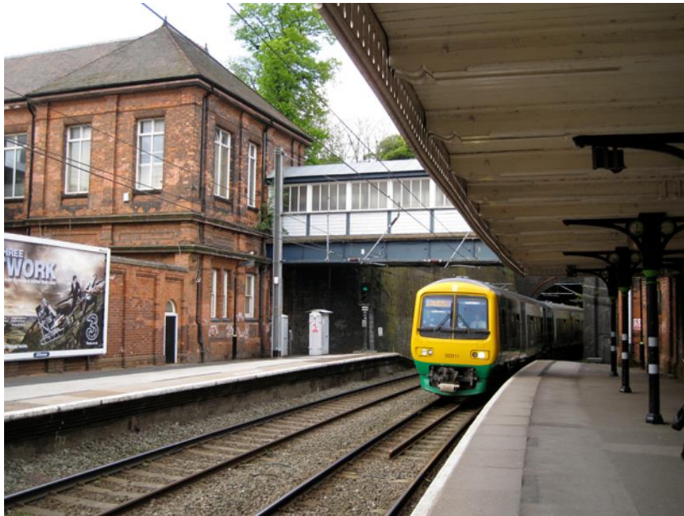
The current Sutton Coldfield railway station, with a CrossCity line service operated by West Midlands Trains pulling out of the platform.

Services wouldn't just run between Walsall and Sutton Coldfield, but also all the way down to Water Orton, to meet with CrossCountry services to Nottingham, Leicester, and Birmingham New Street.